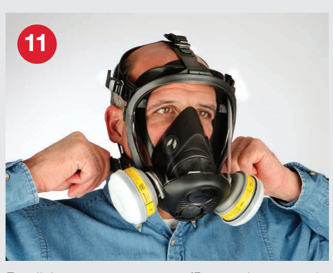
For all three suspension types (5-strap, 4-strap, and headnet), start with the lower straps, tighten both sides evenly. Or, with one hand holding the front of the facepiece, use your free hand to tighten each strap alternately in small, equal increments. Then, tighten the upper straps on either side of the forehead. If you are using the RU6500 with headnet, smooth the headnet over the top and back of your head until lying flat.