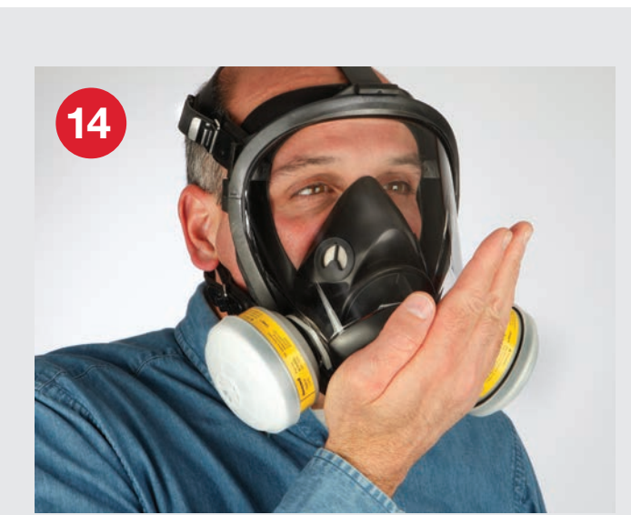
Positive Pressure Seal Check: Place the palm of your hand over the exhalation valve so it is completely sealed and exhale gently. If you have a good seal, the facepiece will be pushed away from your face very slightly.

If any air leaks are detected during either check, reposition the facepiece and/or readjust the head straps including loosening the straps, if they have been overtightened. Repeat the seal check(s) until a seal is obtained.