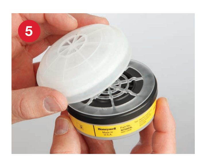
Place the pad filter support on top of the cartridge, "groove side up". Then, snap the filter cover onto the cartridge or N750037 filter holder and cover (if a cartridge is not being used).