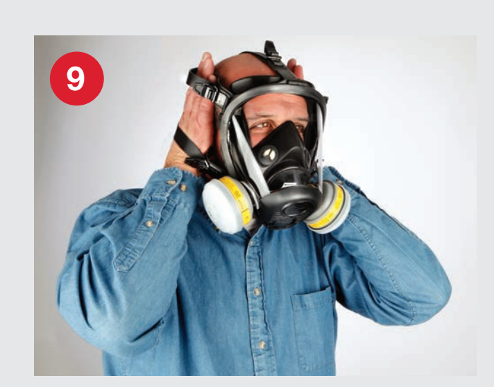
Place the headstraps on your head, pushing any hair backward and away from your forehead. Continue pulling the straps over your head until the harness is centered toward the back of your head. DO NOT TIGHTEN AT THIS TIME.