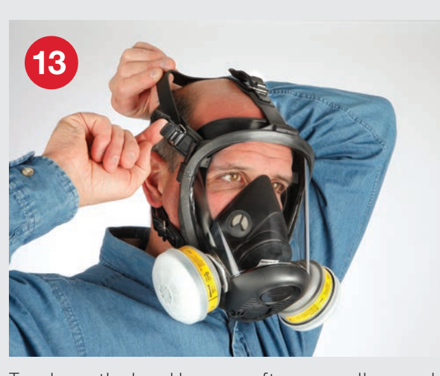
To release the head harness after use, pull upward on the tabs until the straps slide freely.