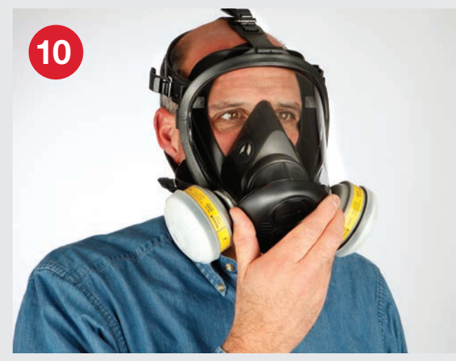
Start by placing the top of the nose cup over the bridge of your nose. Bring the bottom of the nose cup to your chin, centering the mask on your face. Holding on to the mask nozzle, press towards your face until you achieve full face-to-seal contact.