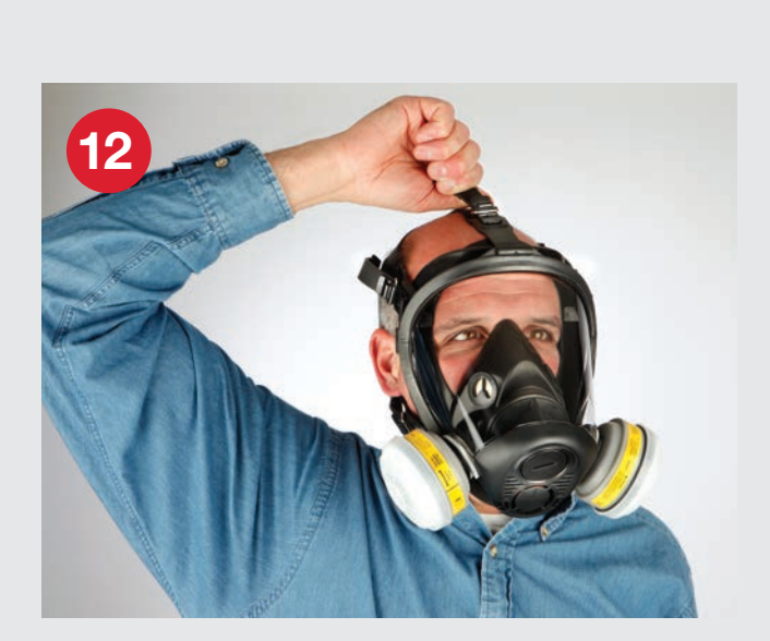
If you have the 7600 five strap harness, tighten the forehead headstrap. The facepiece should be snug, comfortable and centered on your face. DO NOT OVER TIGHTEN any of the suspensions.