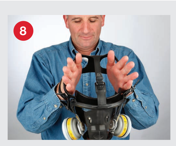
Grasp the headstrap harness, with your thumbs positioned through the straps. Spread the straps outward.