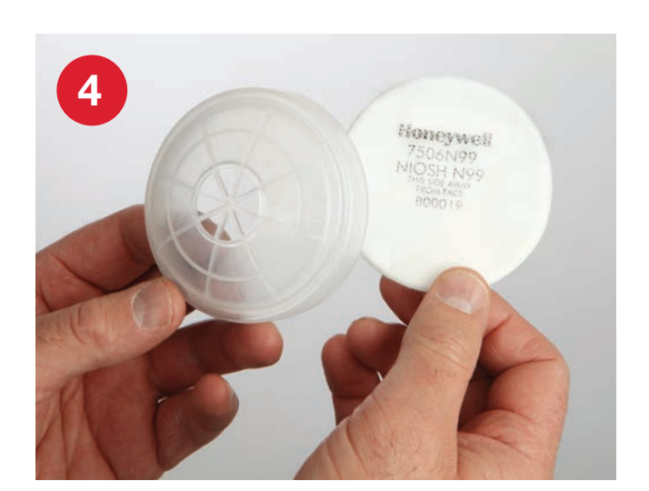
For pad filters only: Insert the pad filter into the filter cover following the directions on the filter so it is facing the correct direction.

If replaceable particulate filters are not used, go to step 6.