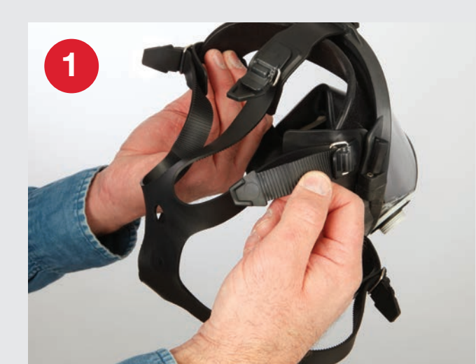
Check the facepiece seal & headstraps (or headnet suspension) to make sure they are in good condition, without any holes or tears. Check the cartridge connectors to make sure they are not cracked and are fully inserted into the mask.

Note: The RU6500 comes with either a 5-strap suspension or 4-strap with mesh headnet