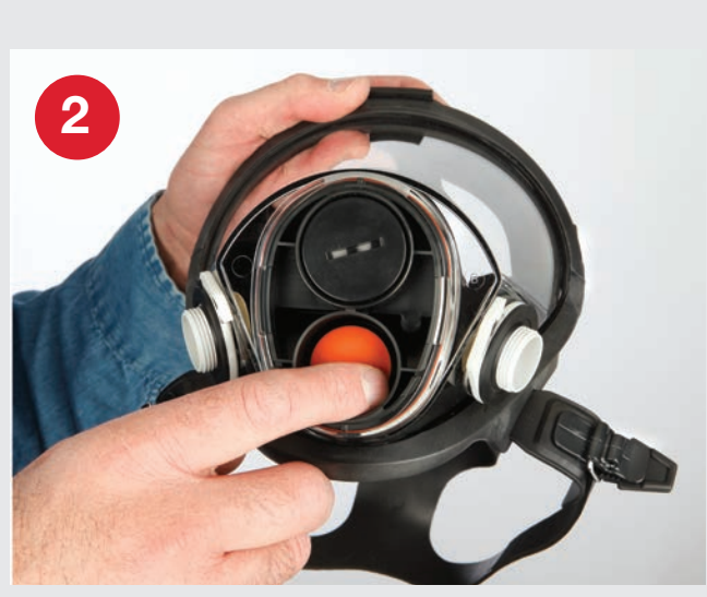
Check all the valves to be sure they are present and in good condition. They should be lying flat, without any distortion, tears or holes.