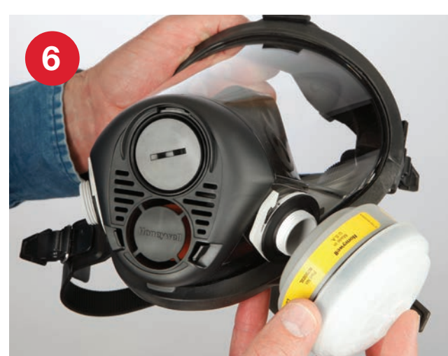
Thread the cartridges or filter assemblies onto the cartridge connectors in the facepiece. Be careful not to overtighten.