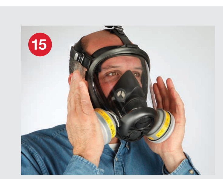
Negative Pressure Seal Check: Place the palm of each hand over the two cartridges or filters so they are completely sealed and inhale. Hold your breath for 5 seconds. If you have a good seal the facepiece will be pulled inward toward your face.

For more information www.honeywellsafety.com Technical Service: 800.873.5242